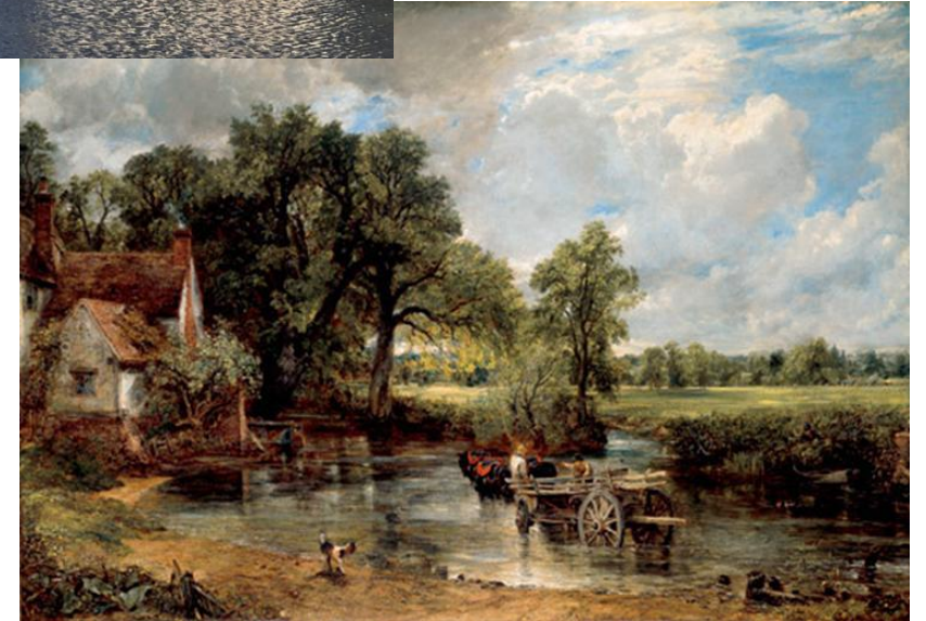
Willy Lott's Cottage /The Haywain